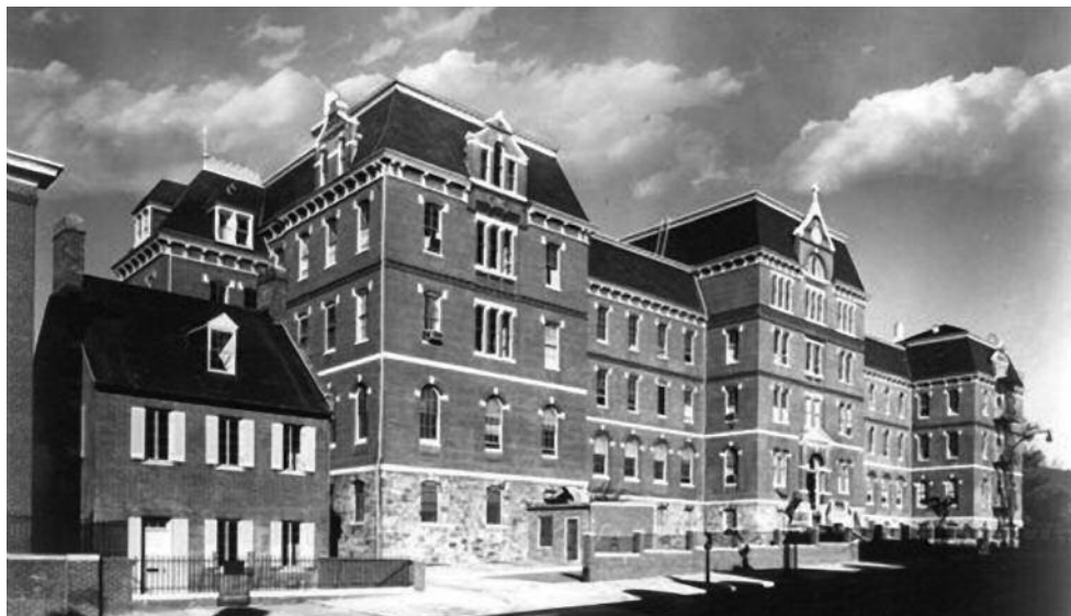
St. Mary's Seminary, Paca Street (circa 1960s)