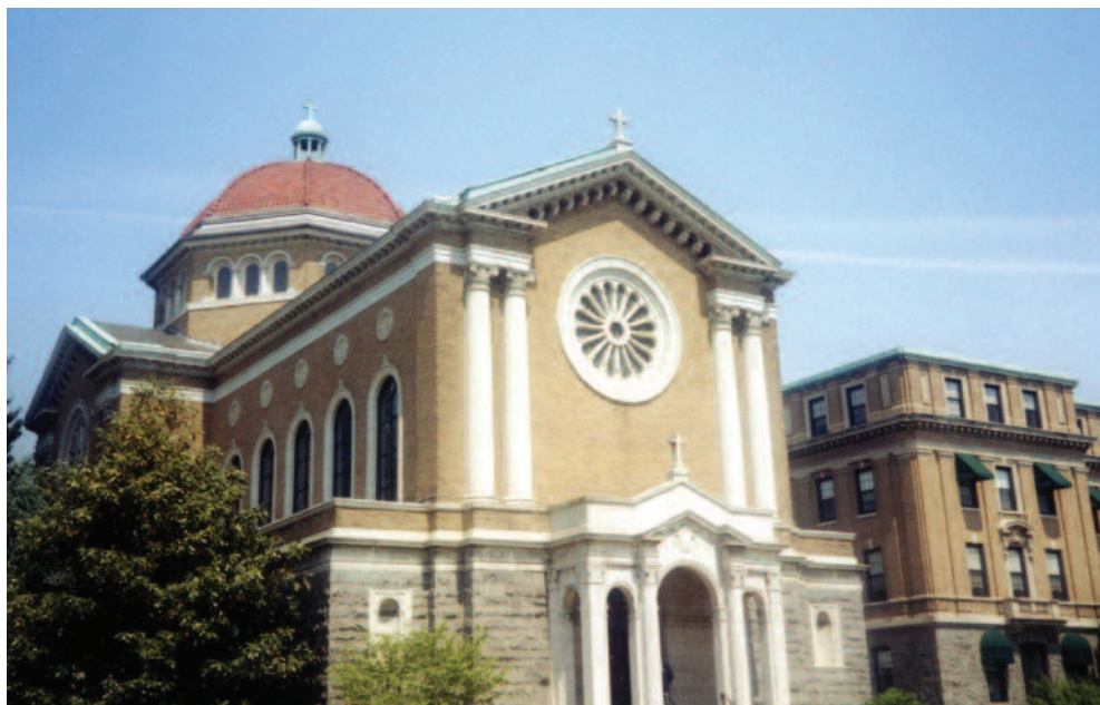
Our Lady of the Angels Chapel on the grounds of the former St. Charles College.

In 2002 St. Mary's Seminary & University created the Raymond E. Brown Center, expanding the Knott Library and providing further classroom resources. It also houses the late Father Raymond Brown's Johannine research collection, and the Associated Archives, which include the historical records of St. Mary's Seminary & University, the Society of St. Sulpice, and the Archdiocese of Baltimore. They jointly contain many of the most important documents of the history of the Catholic Church in the United States. Access to both is limited by appointment to qualified scholars and researchers.