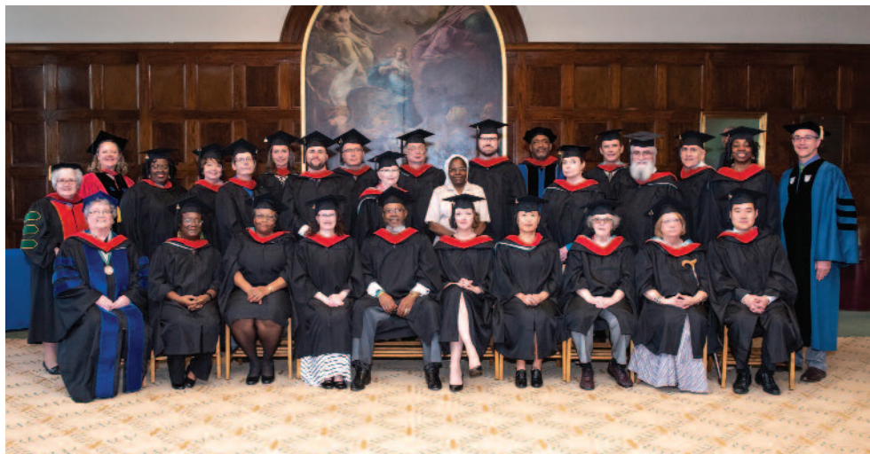
St. Mary's Ecumenical Institute Graduates 2019

St. Mary's Ecumenical Institute (EI) is a division of St. Mary's Seminary & University which offers accredited ecumenical theological education at the Master of Arts and Doctor of Ministry (D.Min.) levels to qualified men and women in the greater Baltimore area. The EI provides opportunities for personal or professional enrichment; preparation for voluntary or professional leadership in a church, school, or community organization; and a basic theological foundation for ministry.