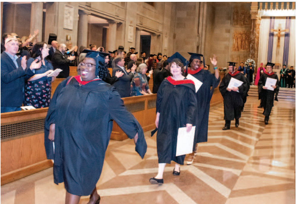
Jubilant Graduates of St. Mary's Ecumenical Institute, Graduation 2109

A diverse learning community pursuing professional excellence and personal growth through theological study