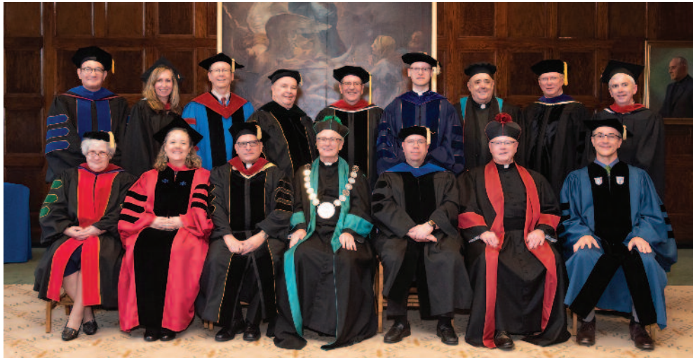
School of Theology Faculty, Graduation 2019

St. Mary's Seminary faculty emphasizes the following goals in teaching theology as part of its program of priestly formation, and assesses students accordingly.