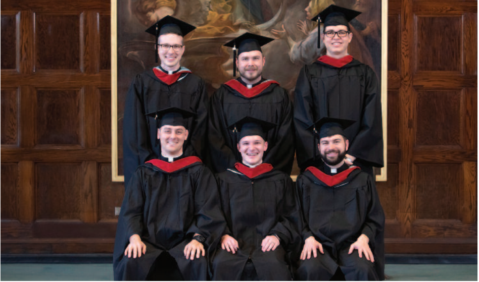
Ordination Class 2019

St. Mary's School of Theology offers professional and academic degree programs to resident seminarians and non-resident day students. The curricula for the several degrees are integrated into the fundamental curriculum required of all candidates for the Roman Catholic priesthood. For this reason all School of Theology courses have as their focus the preparation for priesthood in the Roman Catholic Church.