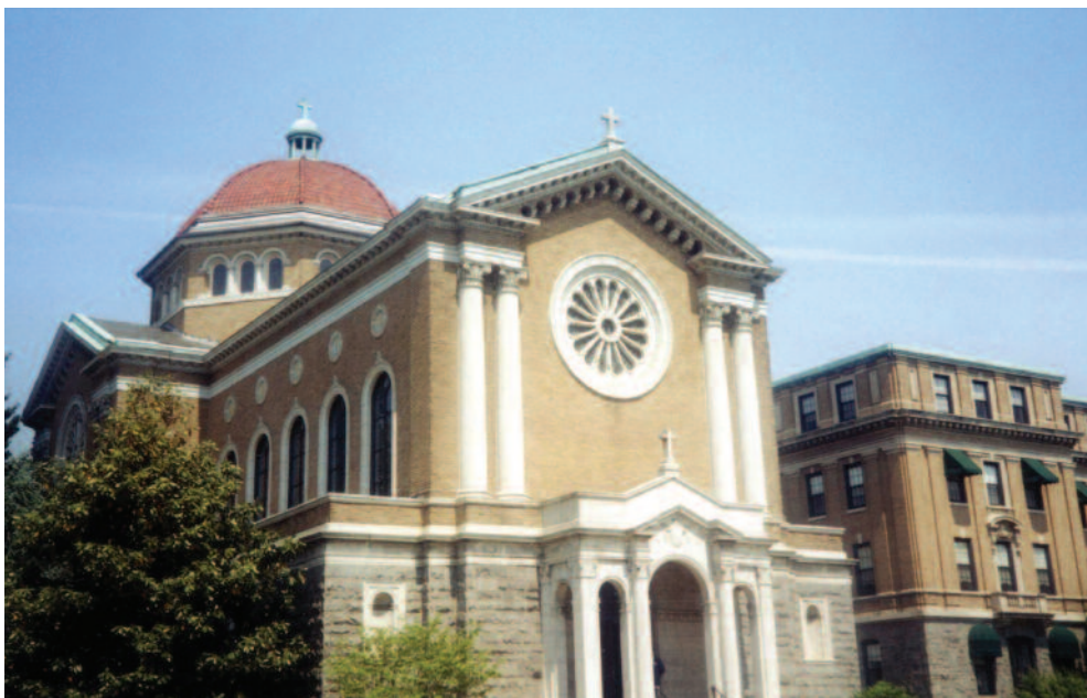
Our Lady of the Angels Chapel on the grounds of the former St. Charles College.

In 2002 St. Mary's Seminary & University created the Raymond E. Brown Center, expanding the Knott Library and providing further classroom resources. It also houses the late Father Raymond Brown's Johannine research collection, and the Associated Archives, which include the historical records of St. Mary's Seminary & University, the Society of St. Sulpice, and the Archdiocese of Baltimore. They jointly contain many of the most important documents of the history of the Catholic Church in the United States. Access to both is limited by appointment to qualified scholars and researchers.