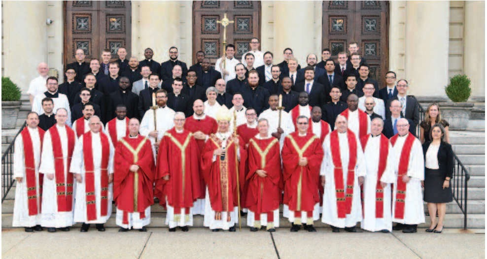
Covenant Mass 2018