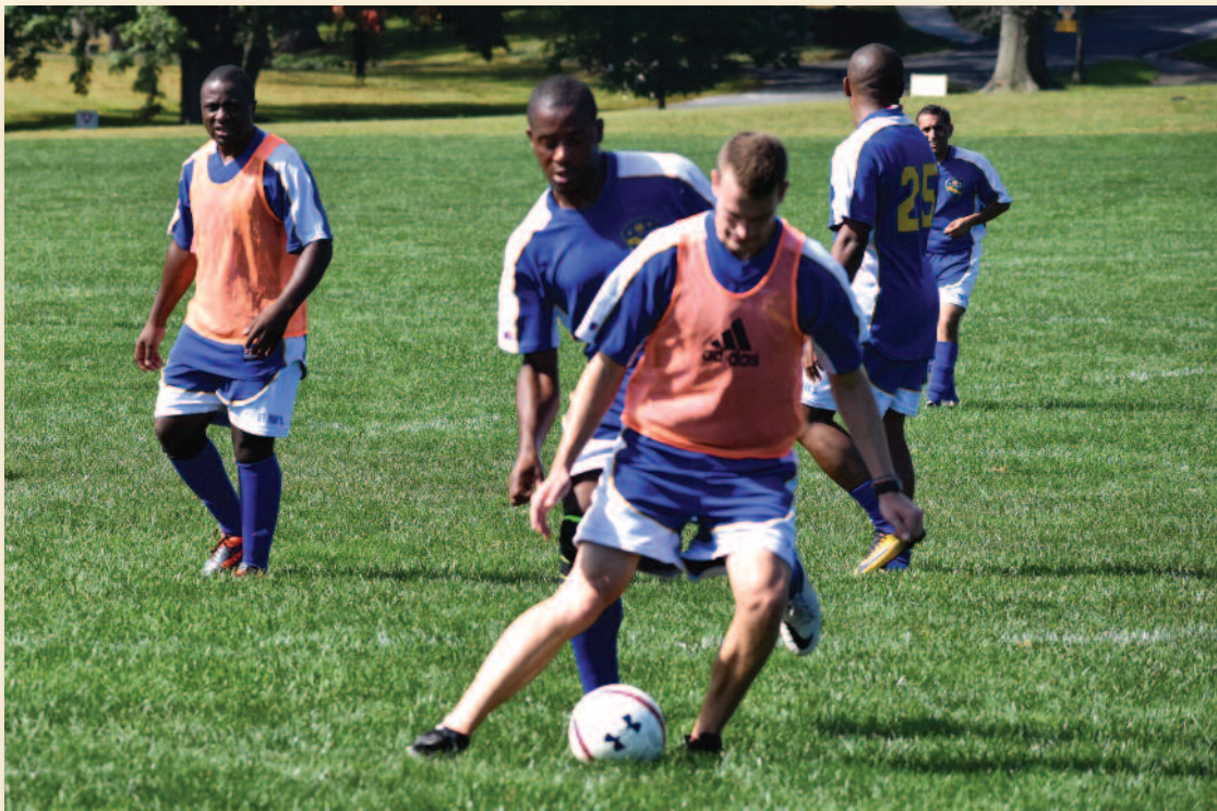
Seminarians during an informal soccer scrimmage on the front lawn. Seminarians at St. Mary's have access to a wide variety of athletic facilities which they utilize throughout the year to stay active and enjoy time together in friendly competition.