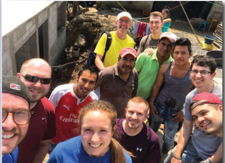
A group selfie taken outside of the home on which we worked most of the week. In the photo are many of the construction workers from Guatemala with whom we served.

The mission trip was generously underwritten by more than 90 individuals and parishioners from the Archdiocese of Baltimore and the Diocese of Wilmington. The full donor listing will appear in next year's annual report.