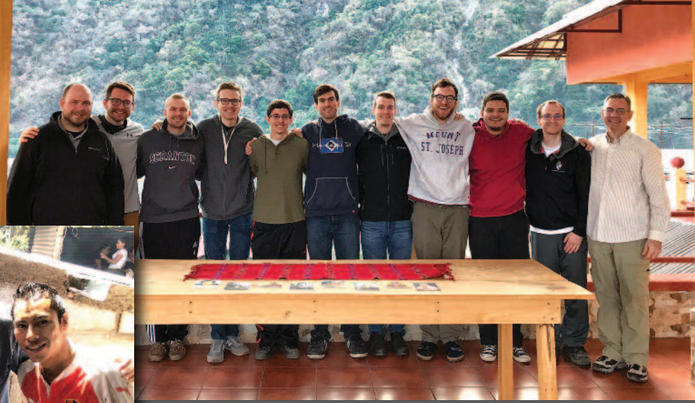
The St. Mary's Seminary group before departing from Guatemala to return to St. Mary's Seminary on the last morning in Guatemala.