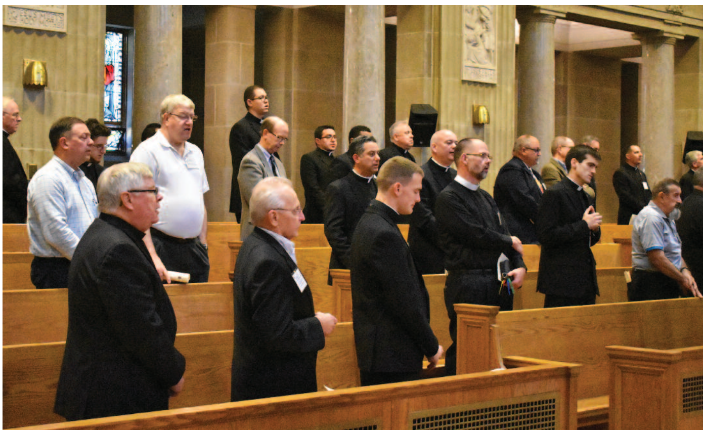
Alumni gather with students for Evening Prayer on Wednesday, October 18, 2017, during the annual alumni celebrations.