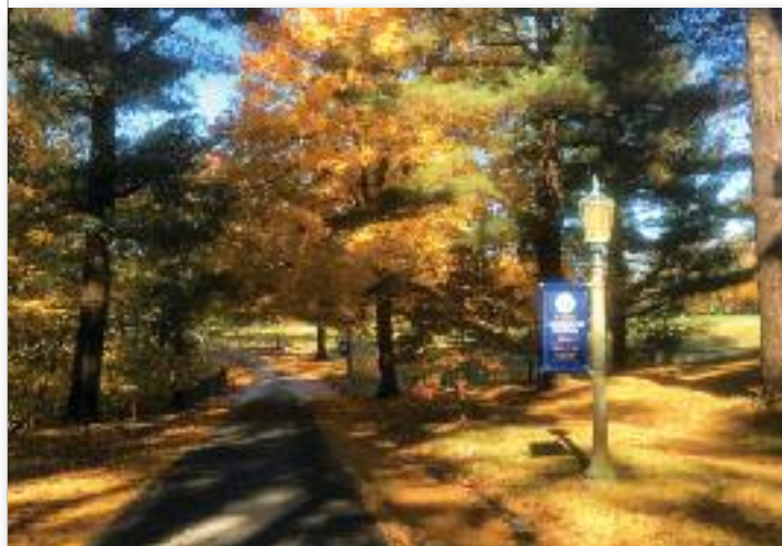
Banners around the St. Mary's campus welcome visitors and announce the 50th anniversary of St. Mary's Ecumenical Institute.

Every effort has been made to ensure the accuracy of the gifts listed in the 2018 Annual Report. Please notify the Advancement Department at 410-864-4264 or ccarr@stmarys.edu if you notice any discrepancies or have any questions.