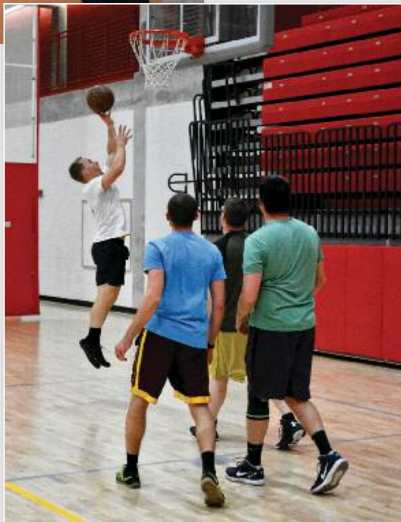
Regular physical exercise is critical to sound human formation. Seminarians enjoy competing in a weekly basketball scrimmage.