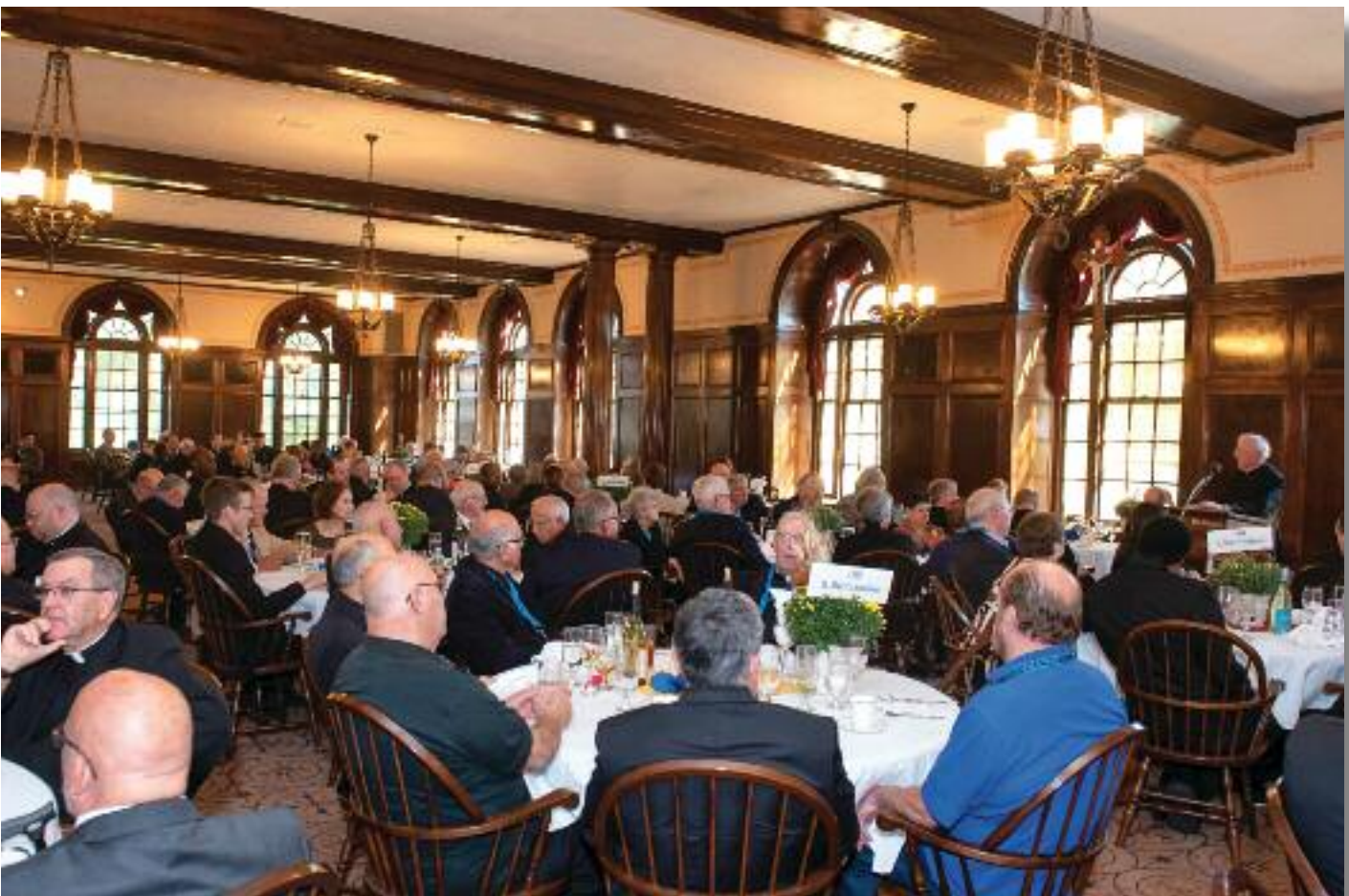
Alumni Day Luncheon, October 18, 2018.