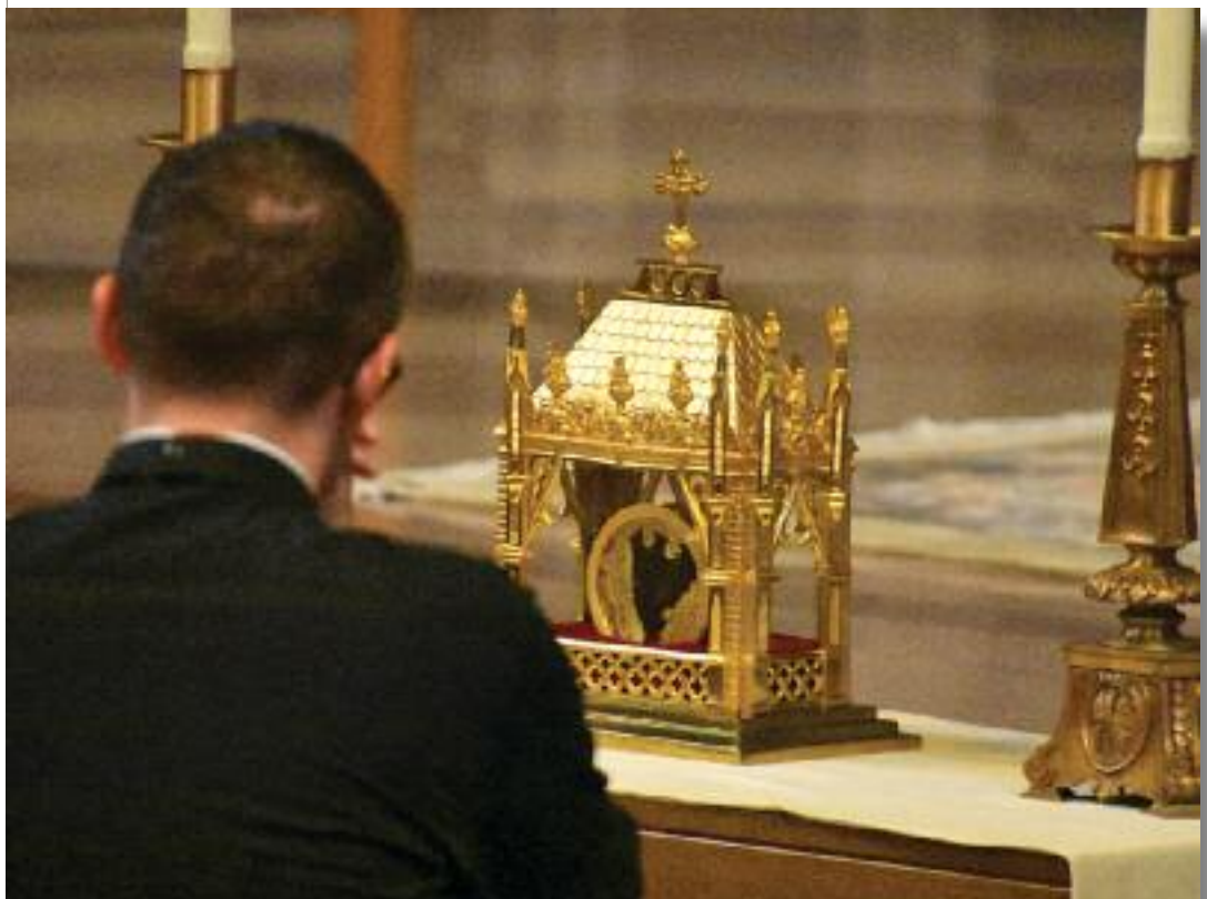
Veneration of the relic of the incorrupt heart of St. John Vianney in St. Mary's Chapel, sponsored by the Knights of Columbus in November, 2018.