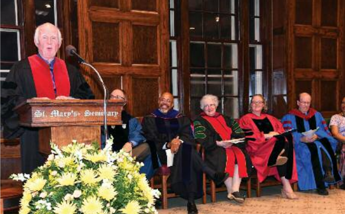
Taylor Branch, the Pulitzer Prize winning author of Parting the Waters: America in the King Years, spoke at the El's Jubilee Convocation about the context in Baltimore in 1968 when the El first opened its doors.