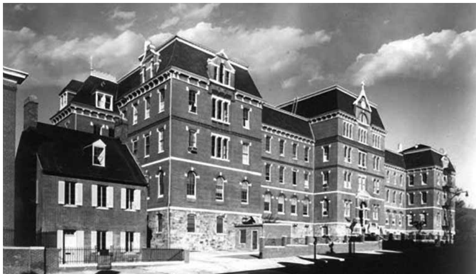
St. Mary's Seminary, Paca Street (circa 1960s)