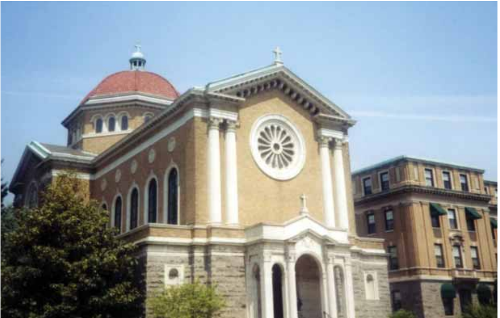
Our Lady of the Angels Chapel on the grounds of the former St. Charles College.